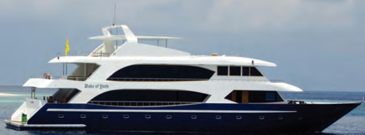
MY DUKE OF YORK