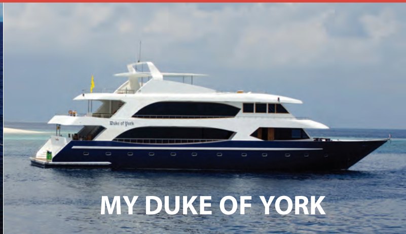
MY DUKE OF YORK

The accommodation on board our boats (superior - luxury category motor yachts) is provided in double cabins with private bathrooms, and air conditioning. Full board includes typical International and Italian cuisine based on fresh fish. On board you will be exclusive guests welcomed according to the clichés of the proverbial friendliness of the Luxury Yacht Maldives staff.