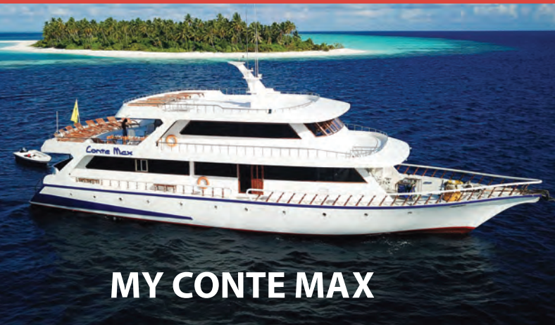
MY CONTE MAX